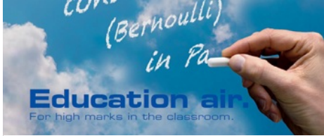
EDUCATION AIR. FOR HIGH MARKS IN THE CLASSROOM.