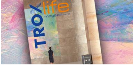
SPORTS AND CULTURE. ARTFUL AIR DESIGN