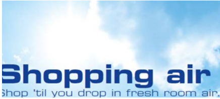
HOPPING AIR HOP 'TIL YOU DROP IN FRESH ROOM AIR.