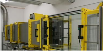
FOR HIGHEST DEMANDS FILTER TECHNOLOGY