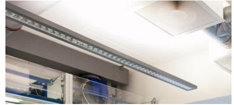
LABORATORY TECHNOLOGY DEMO ROOM