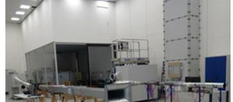
TEST FACILITIES CONTROL TECHNOLOGY