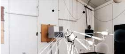
MEASUREMENTS ON SOUND ATTENUATORS ACOUSTICS