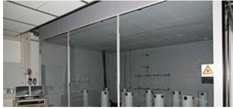
TEST FACILITIES AIR DISTRIBUTION TECHNOLOGY